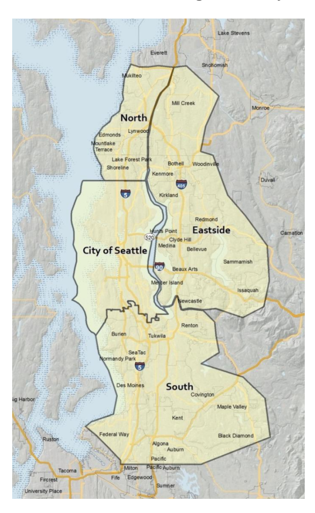
Exhibit 14. Commuter Regions Analyzed