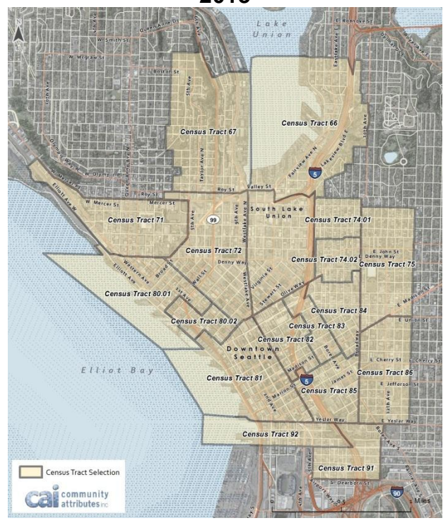
Exhibit 3. Census Tracts Analyzed, City of Seattle, 2013

The South Lake Union neighborhood is located north of Seattle's Downtown core. The neighborhood is bound to the West by Aurora Ave N, to the North by Lake Union, to the East by Interstate 5, and to the South by Denny Way. Exhibit 4 maps the neighborhood boundaries, as defined by the Urban Center designation in the Comprehensive Plan.