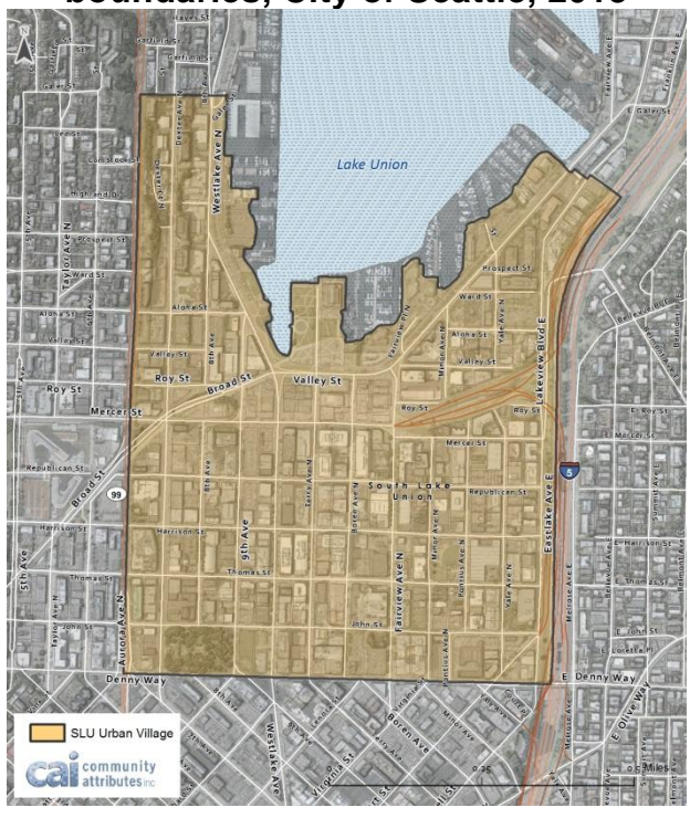
Exhibit 4. South Lake Union Urban Center boundaries, City of Seattle, 2013

The South Lake Union neighborhood is located north of Seattle's Downtown core. The neighborhood is bound to the West by Aurora Ave N, to the North by Lake Union, to the East by Interstate 5, and to the South by Denny Way. Exhibit 4 maps the neighborhood boundaries, as defined by the Urban Center designation in the Comprehensive Plan.