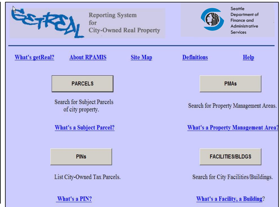
Inweb Access (limited data)