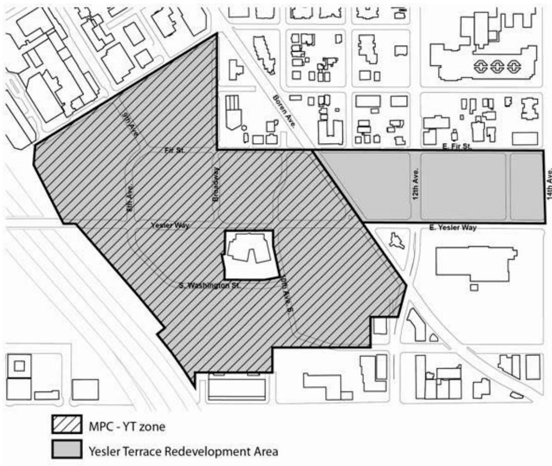
Figure 1: MPC-YT zone and Yesler Terrace Redevelopment Area