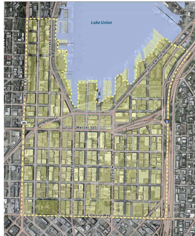
Exhibit 1. South Lake Union Neighborhood