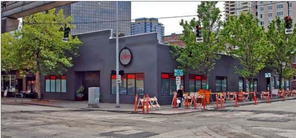
BELOW: Street-level View, looking southwest from the intersection of 5 th Avenue and Bell Street.