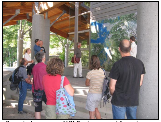
Commissioners tour NCI Environmental Learning Center during annual retreat.

SEEC continues the implementation of its Five-year Workplan developed at its 2008 annual retreat. The Commission is working with established partners with a focus on the following initiatives: