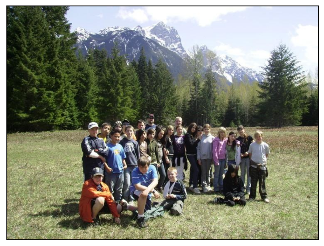
Students from Fraser-Cascade Mountain School explore Chittenden Meadows, near Hozomeen at the head of Ross lake