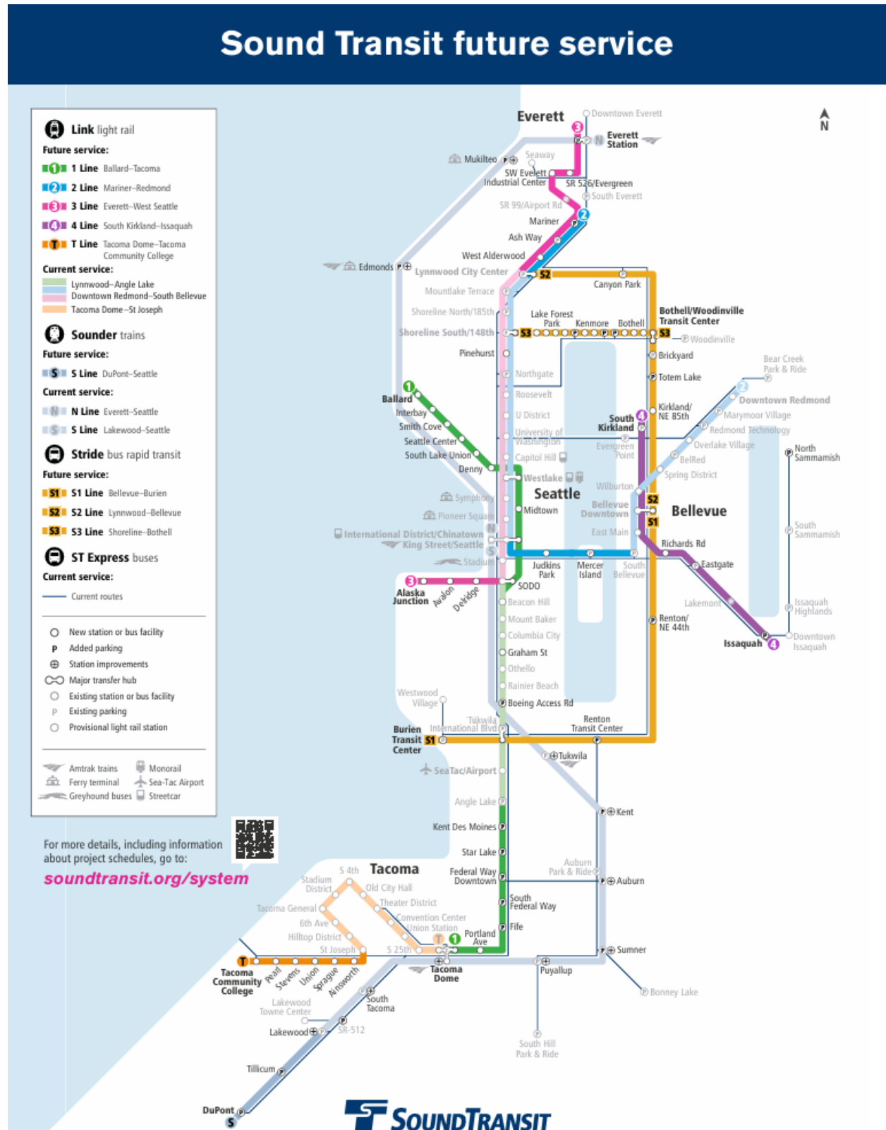
Exhibit A: Sound Transit Future Service Map, May 2025