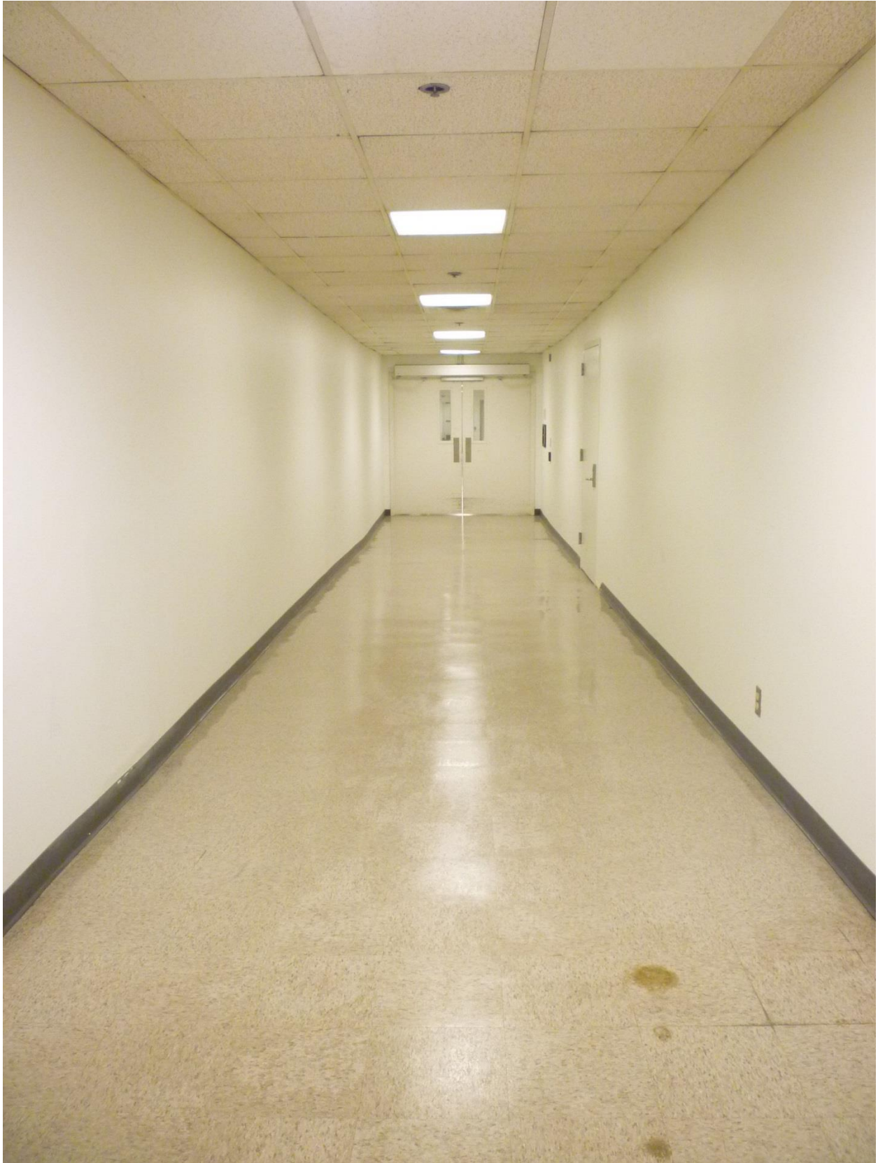
Attachment B –Swedish Minor Tunnel Photo