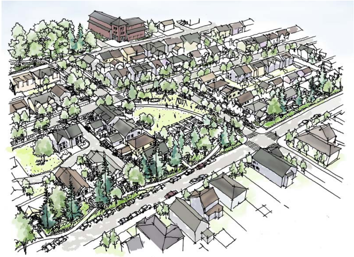
36 th Avenue West and Neighborhood Park