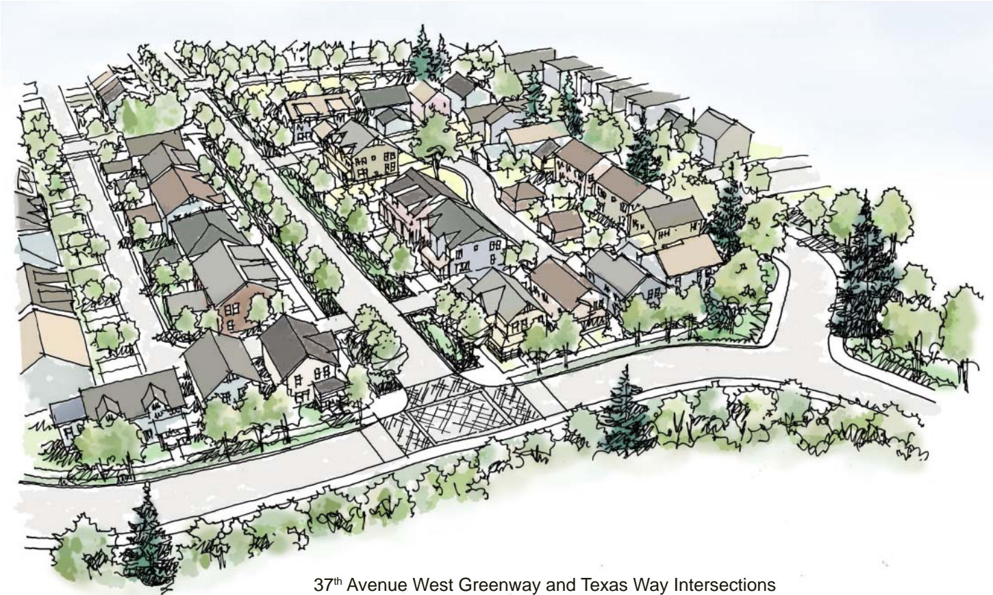
37 th Avenue West Greenway and Texas Way Intersections