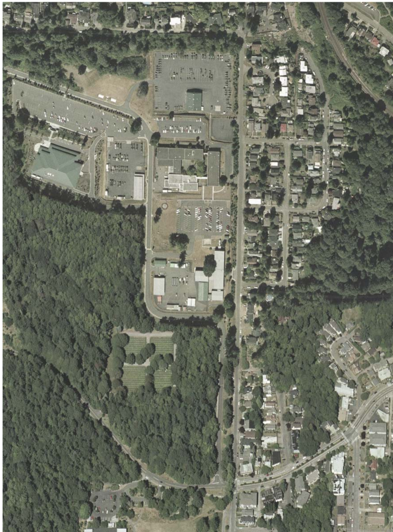
Fort Lawton Existing Aerial July 19, 2008