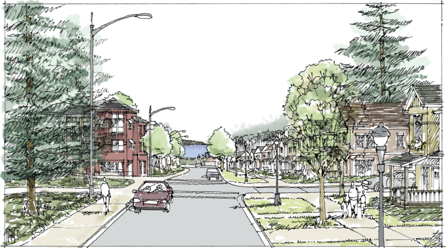
Texas Way West – North to View Park and Salmon Bay