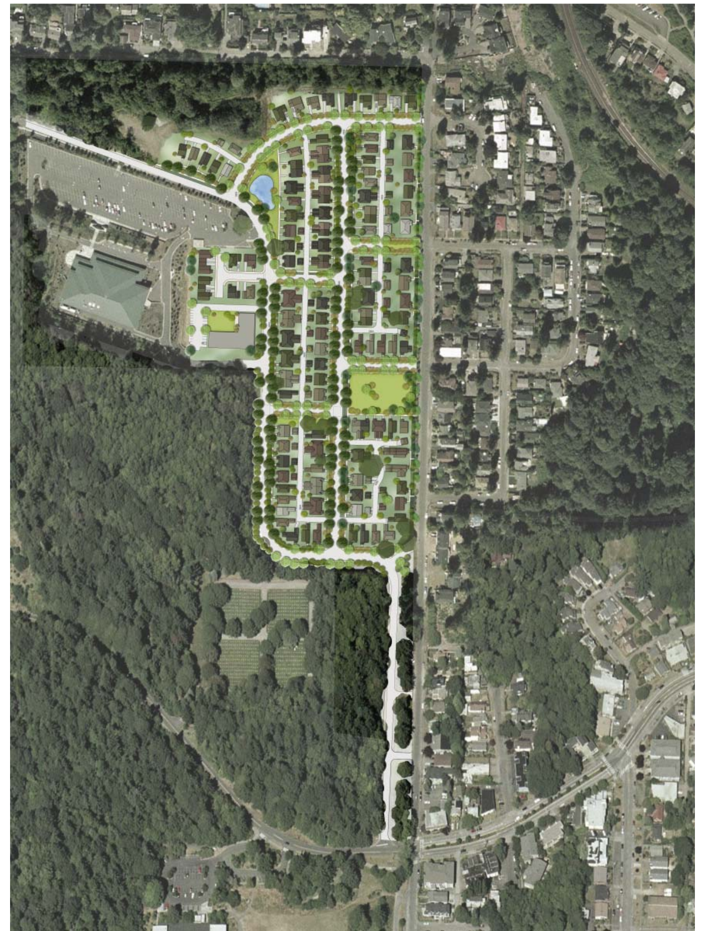
Fort Lawton Redevelopment Plan July 19 2008