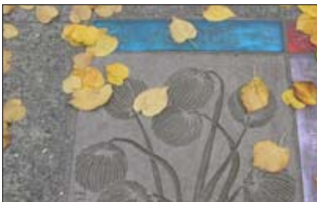
The integration of public art is encouraged at the street level and in the streetscape (See Queen Anne Avenue streetscape master plan.)