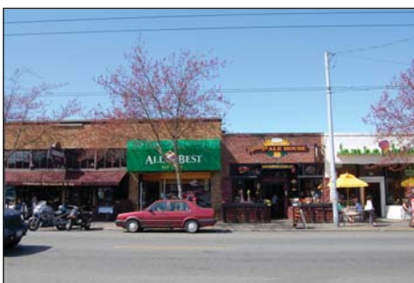
Pedestrian-scaled signs are encouraged.