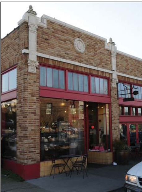
Provide individualized storefronts