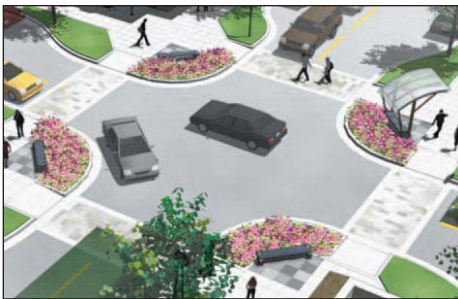
Landscaped curb bulbs are encouraged

Integrate open space design with the design of the building so that each complements the other.