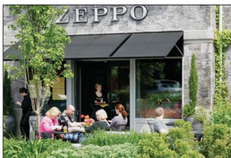
Individualized storefronts and outside dining are encouraged to add human activity

Strengthen the most desirable characteristics and patterns of the streets, block faces, and open spaces in the surrounding area.