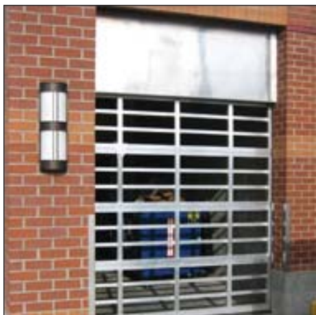
Screening should be used to conceal dumpsters in alleys