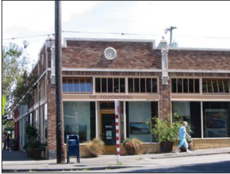
Architectural features should be selected to provide intimate human scale