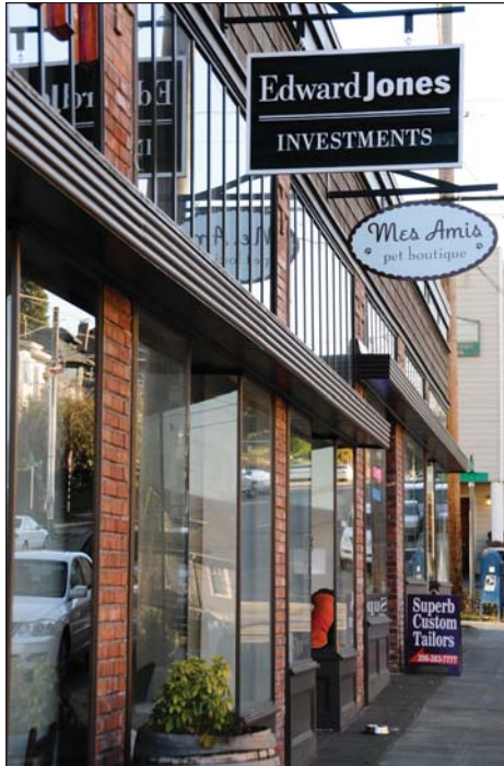
Example of individual storefronts