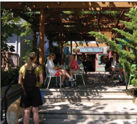
Small local businesses are encouraged and well accommodated in retrofitted older buildings

Encourage human interaction and activity at the street-level with clear connections to building entries and edges.