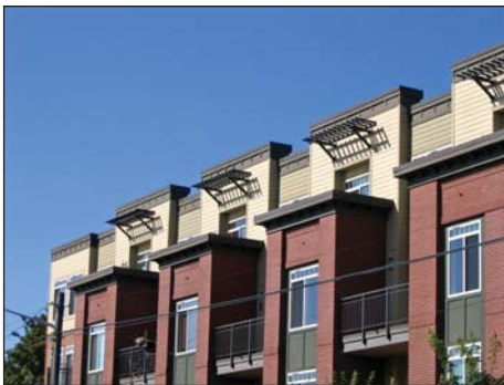
High quality materials and colors compatible with the character of the neighborhood are encouraged