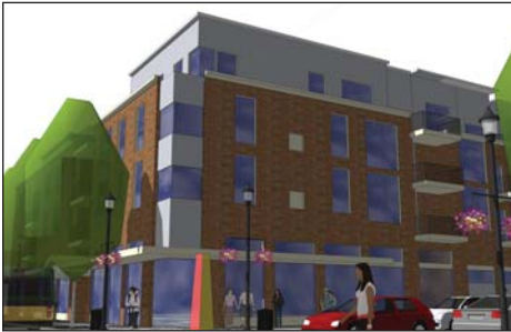
Example of a fourth floor upper level setback to reduce the apparent scale of new development