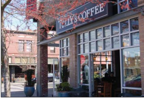
Encourage operable storefronts that expand the effective sidewalk width for outdoor dining