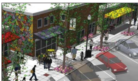
Existing diagonal parking should be preserved and encouraged in retail nodes.

Optimize the arrangement of uses and activities on site.