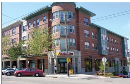
Special building forms and features should be used on corner lots to add open space and visually anchor the block