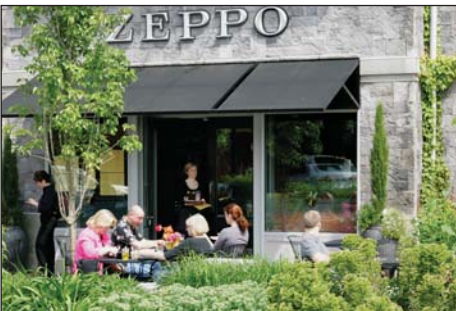
Individualized storefronts and outside dining are encouraged to add human activity