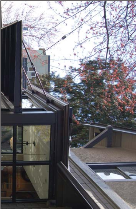
An example of Green factor features contributing to the quality of the streetscape