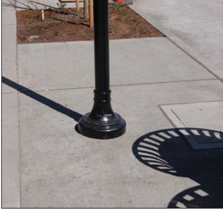
Irrigation and/or use of harvested rainwater (permeable concrete) is encouraged