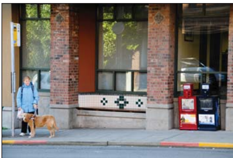
The integration of bus waiting facilities into building frontages avoids the need for free-standing transit shelters.

and uniform awnings or canopies. Pedestrian weather protection that provides for sunlight at the street level, through either clear glass or retractable systems, should be considered. (See related guideline in Architectural Elements and Materials, C-2, Individualized Storefronts)