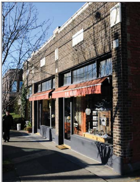
Flexible retail bays