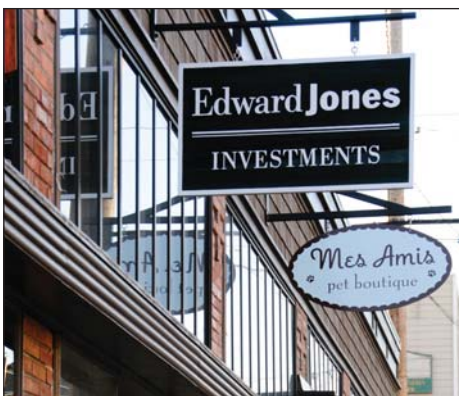
Individual expression in commercial signage is encouraged, rather than uniformity.