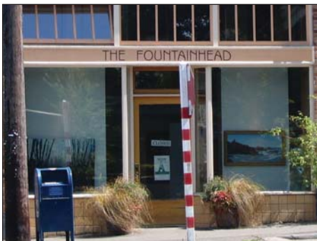
Architectural features should be selected to provide intimate human scale