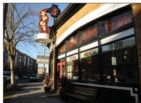
Commercial lighting should enhance the quality of the pedestrian environment.