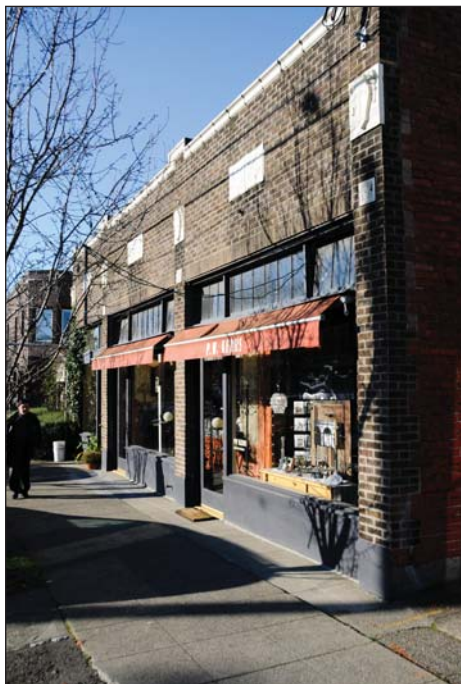
Flexible retail bays