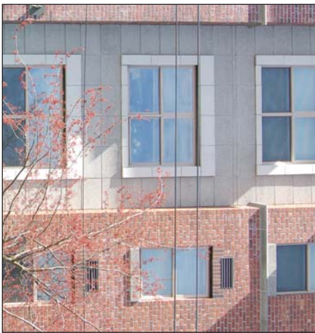
Provide residential entries mid-block or on cross streets, preserving corner retail opportunities

Some pedestrian weather protection, in the form of canopies and awnings over sidewalks, is desirable. However, the community values open air and sunlight, so long, unbroken stretches of overhead protection are discouraged. Structures longer than the traditional 45-foot wide buildings characteristic of Queen Anne should avoid continuous