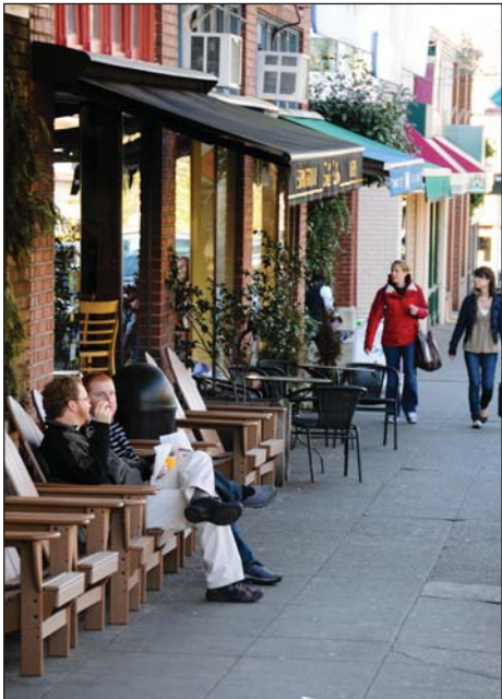
Encourage a variety of awnings and glass canopies unique to each storefront.