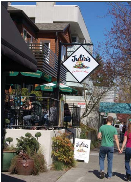
Areas above sidewalk level provide landscaping and outdoor dining opportunities and should be ADA accessible.