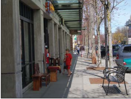
Uniform street tree planting and pedestrian-scale lighting