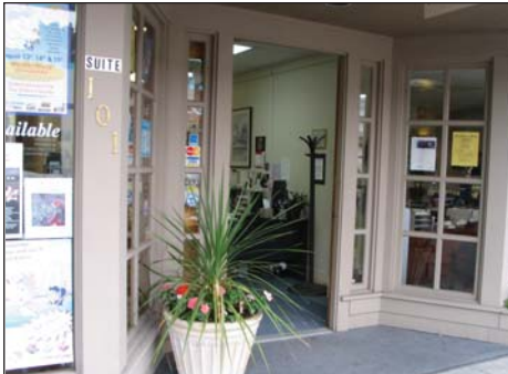
Planted containers are encouraged to make an inviting entry