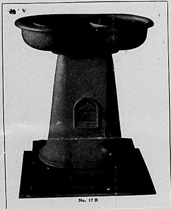
No. 17 B