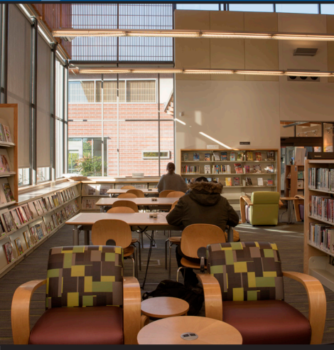
1998 bond measure for buildings