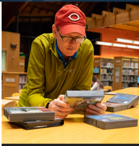
2012 maintenance & operations levy