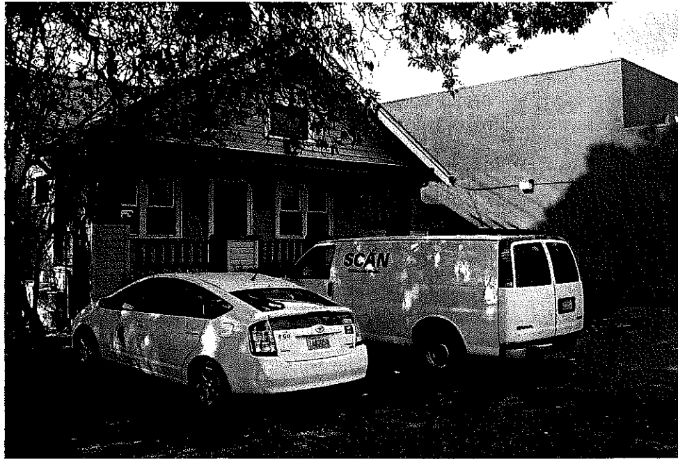
A more recent photo taken in 2011.