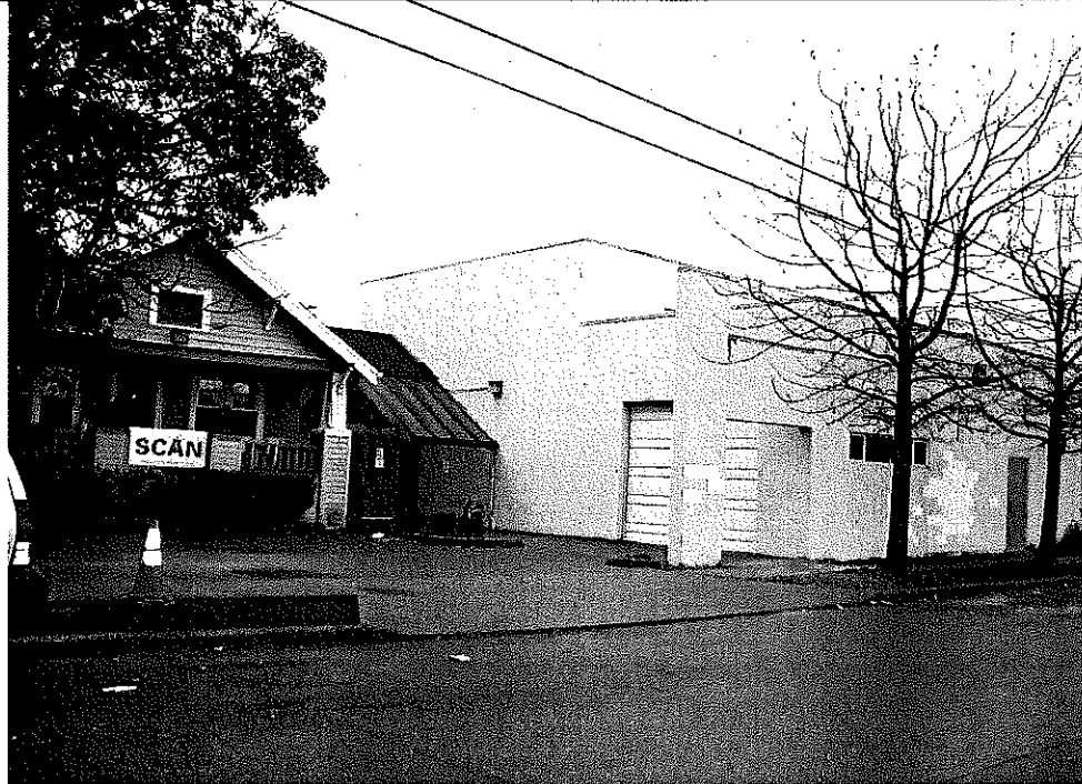
Picture of subject property from King County Assessor's web page from approx. 2007

Dave Barber SCL DOIT to SCL Property Transfer FISC ATT B March 25, 2013 Version #1