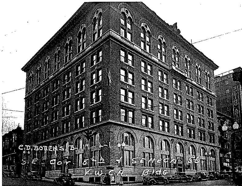
YWCA Building, 1118 Fifth Avenue, c. 1936