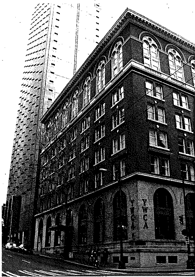
YWCA Building, 1118 Fifth Avenue, c. 2011